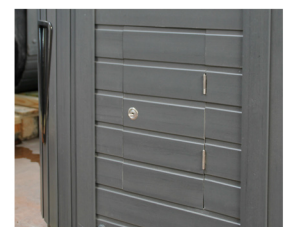
Topside is hidden behind door, only key-holder has access.