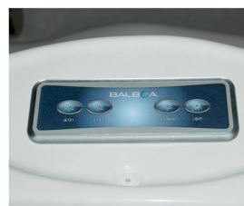
Easy controls, Simple and efficient.