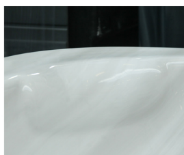
Integrated headrest Durable