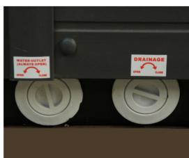
XL External drain for quick drainage